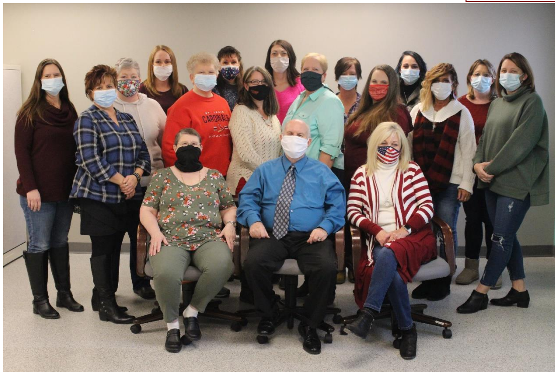
Heartland Staff- December 2020